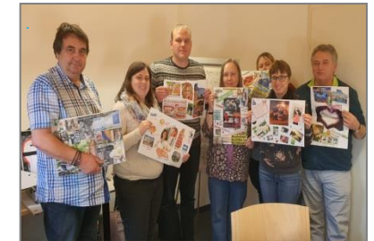
Peer Support Workers in training at Günzburg / Ulm

Six recruiting sites finished pilot testing and training last year. The training was done in local languages that include Gujarati (India), Luganda (Uganda), Swahili (Tanzania), Hebrew (Israel) and German (Germany). The training was well received at each site. We are now in the phase of beginning our trial using the skills of the training.